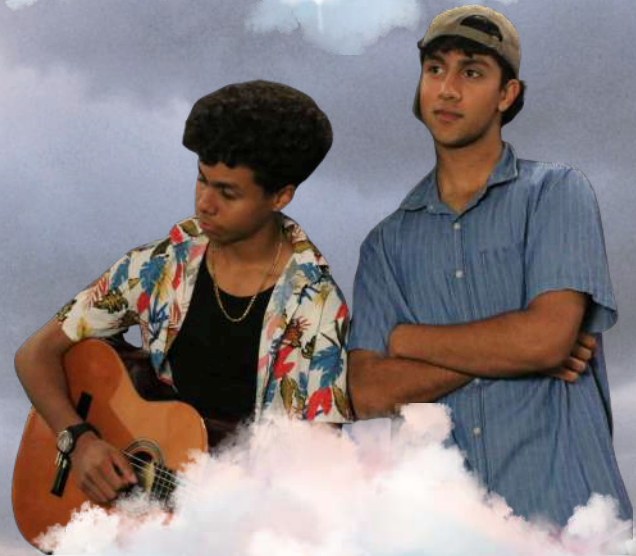
Will music heal his broken heart?