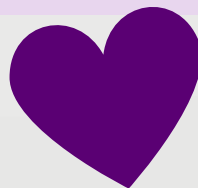
On stage he's the life of the party, but up close... he doubts himself

“I'm not sure I measure up to what she deserves”