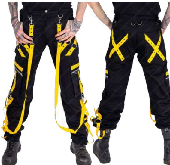
Ribbons, tags and ties